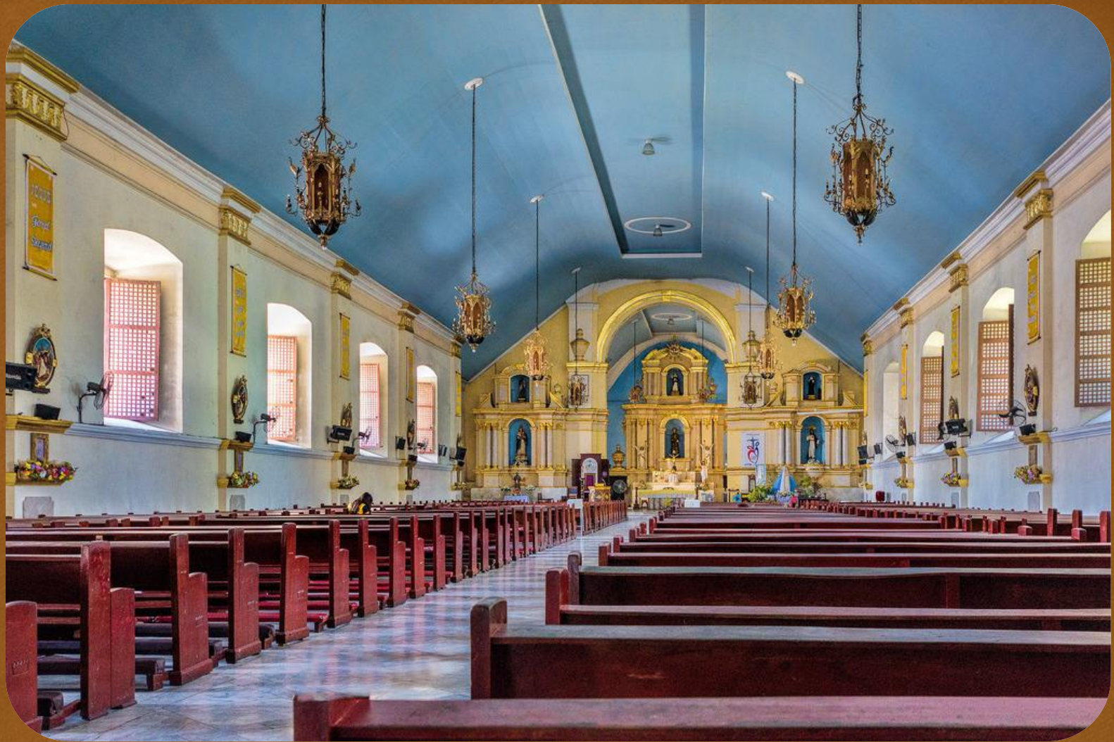
St. William the Hermit Cathedral City of Laoag