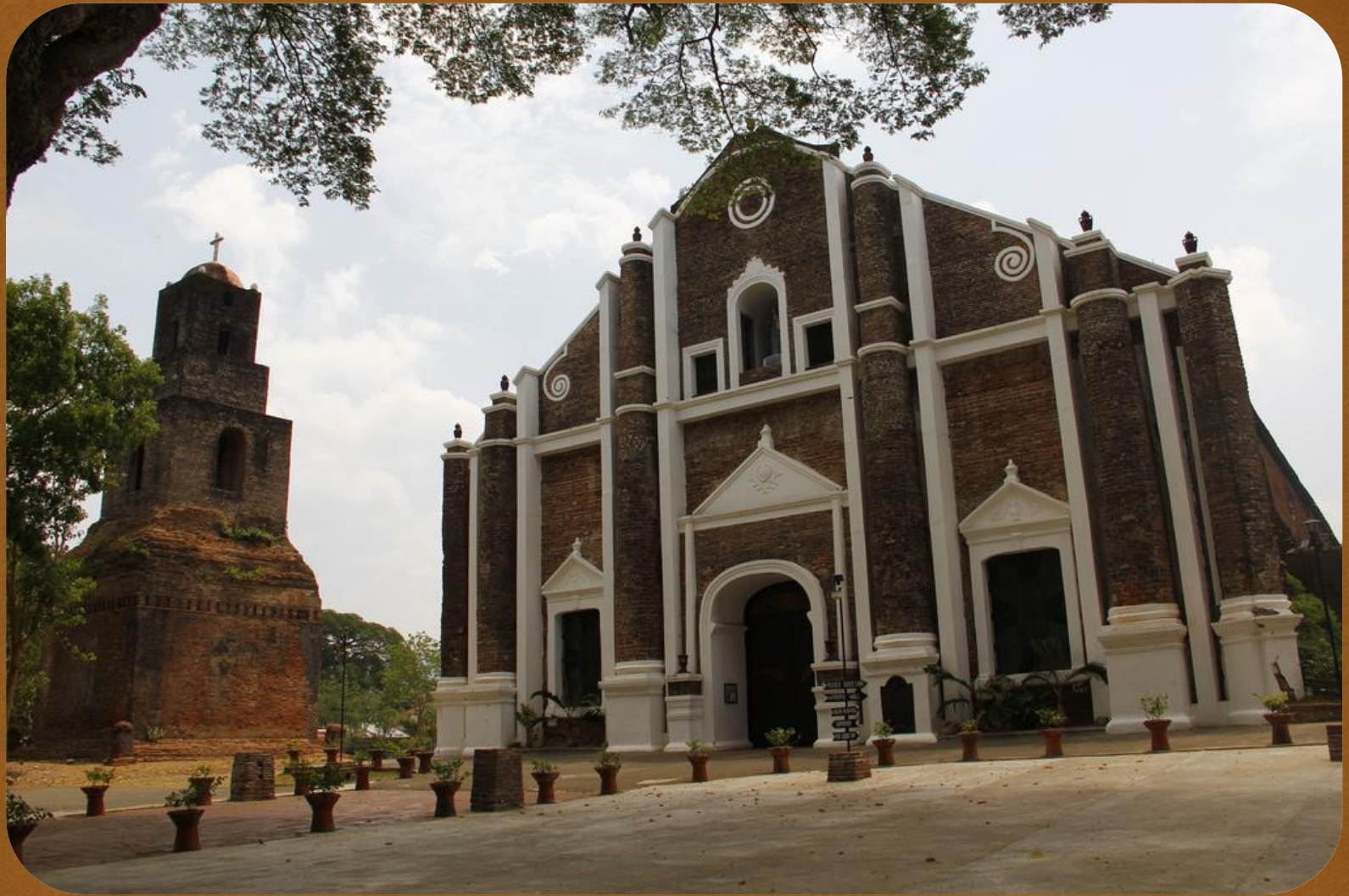
Sta. Monica Church Town of Sarrat