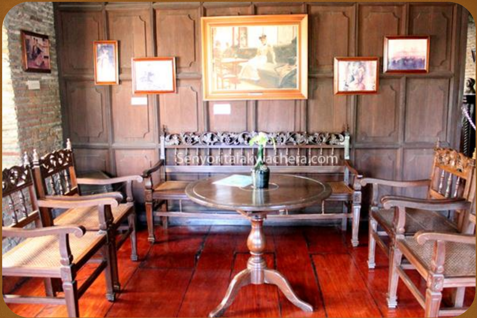
Juan Luna Shrine Town of Badoc