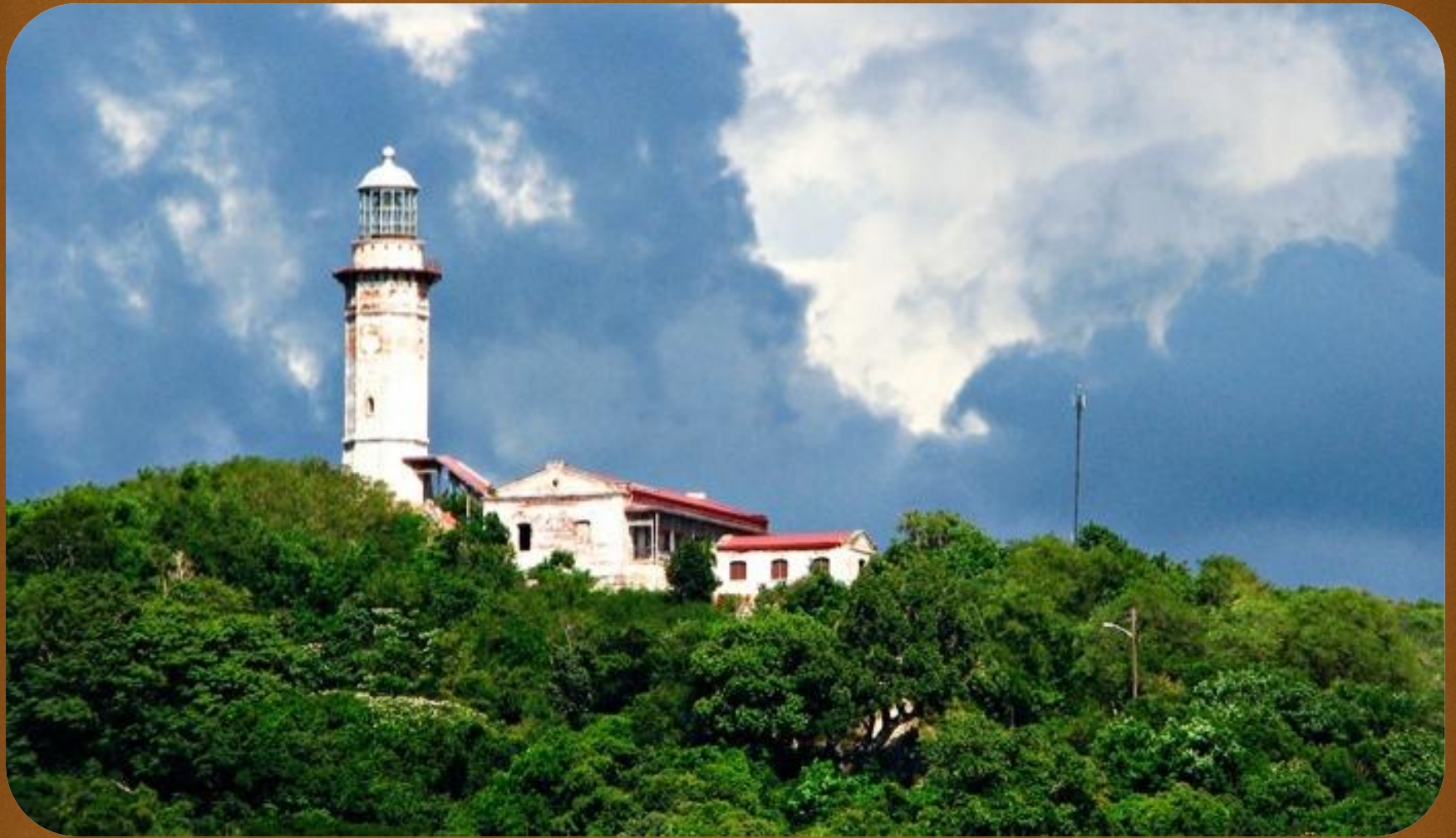
Cape Bojeador Lighthouse Town of Burgos