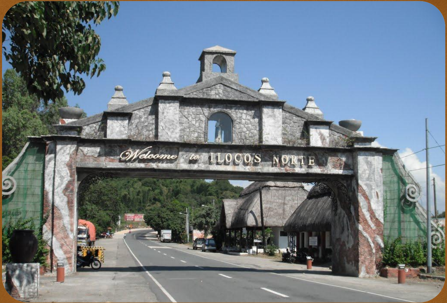
Ilocos Norte Welcome Arch Town of Badoc