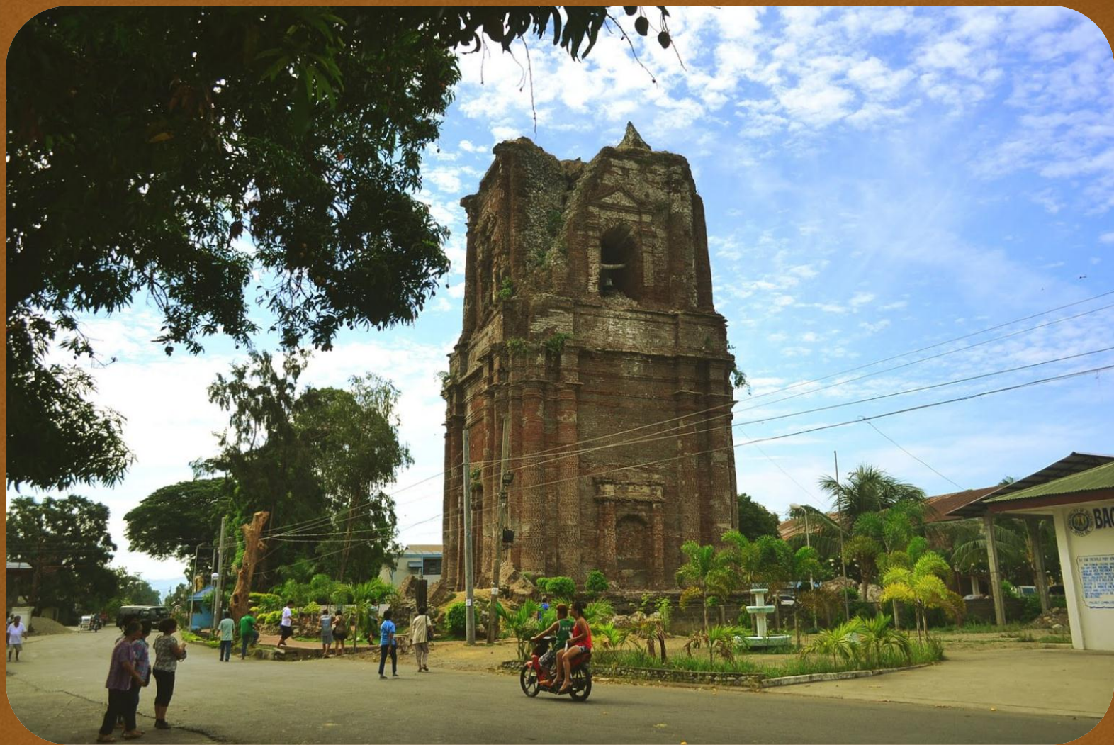
Domeless Bell Tower Town of Bacarra