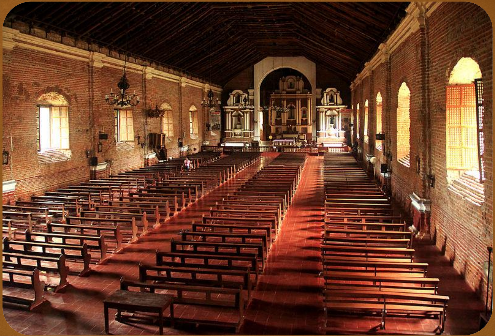
Sta. Monica Church Town of Sarrat