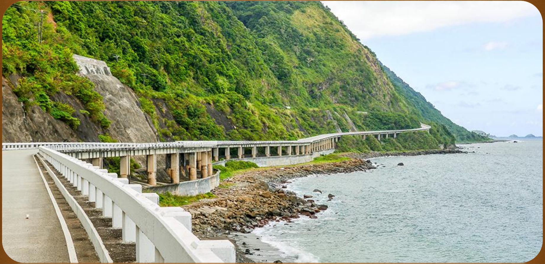
Patapat Viaduct Town of Pagudpud