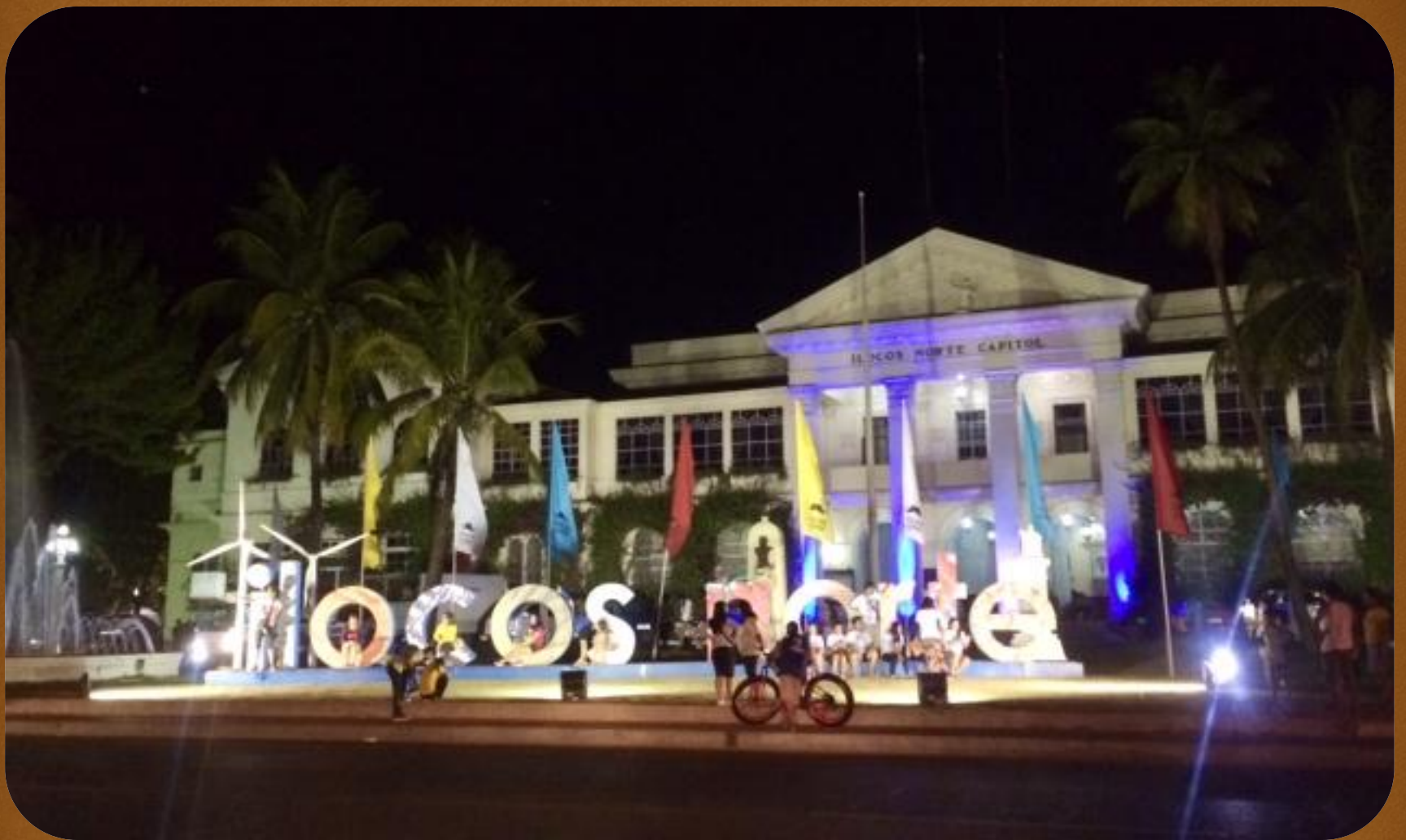
Ilocos Norte Provincial Capitol City of Laoag