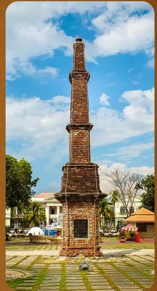
Tobacco Monopoly Monument and Aurora Park City of Laoag