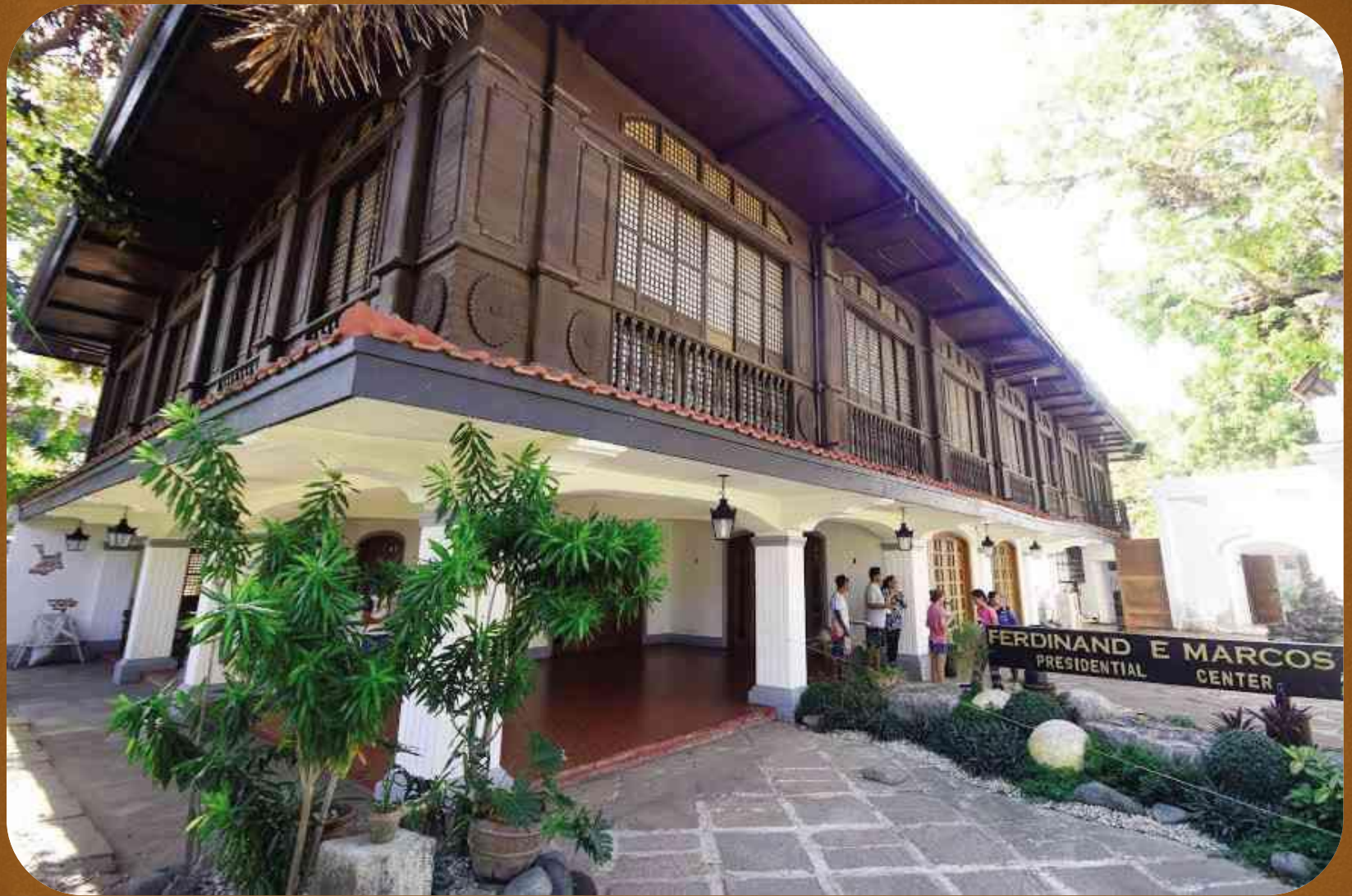
Ferdinand E. Marcos Presidential Center City of Batangas