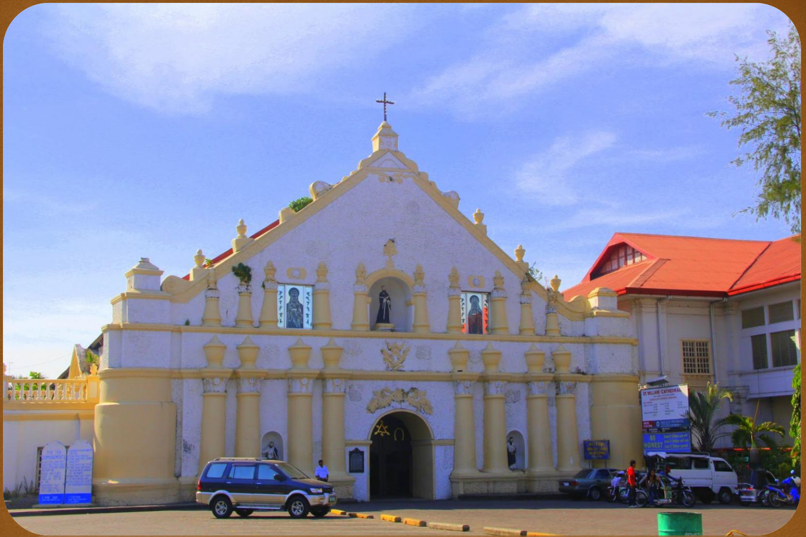
St. William the Hermit Cathedral City of Laoag