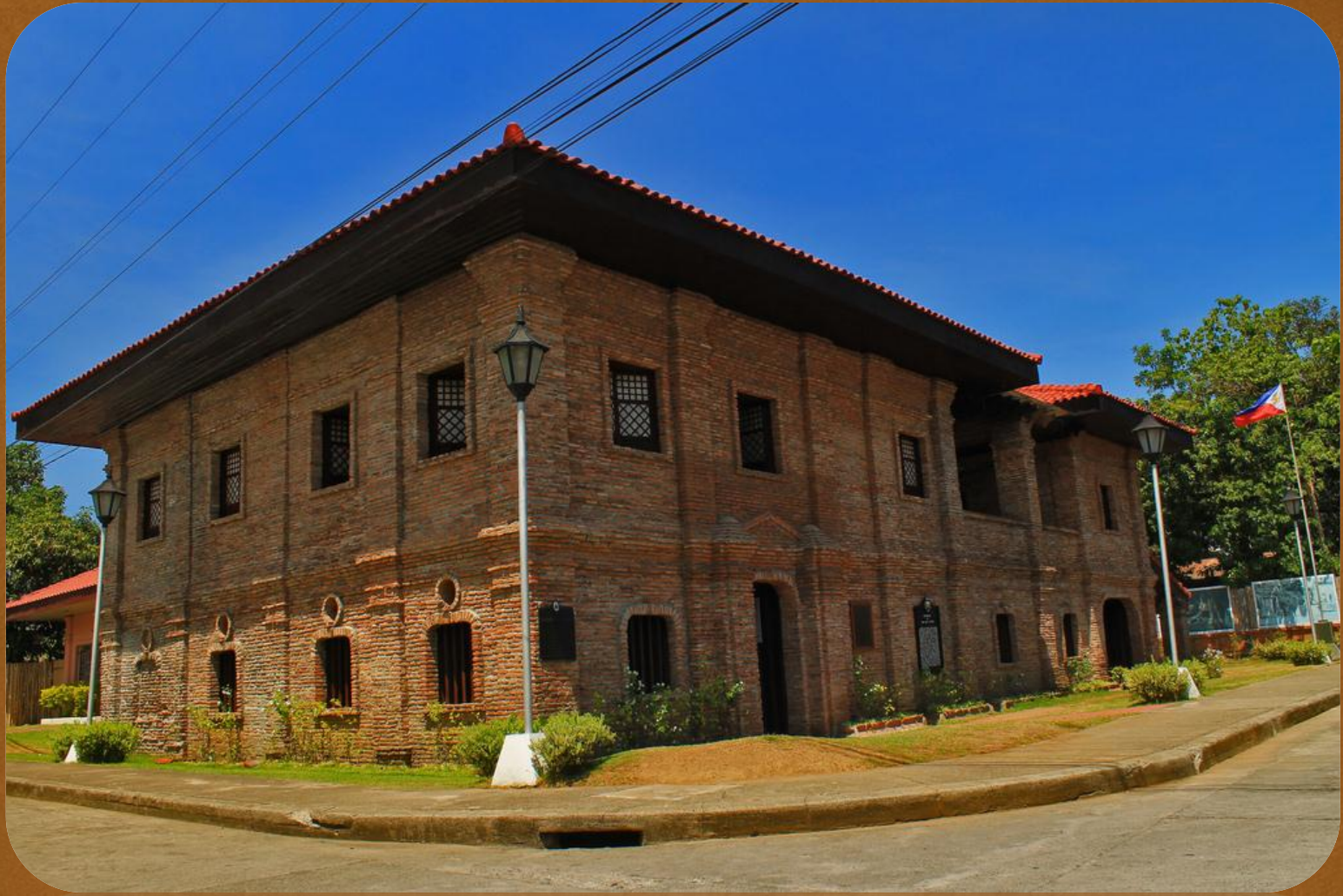
Juan Luna Shrine Town of Badoc