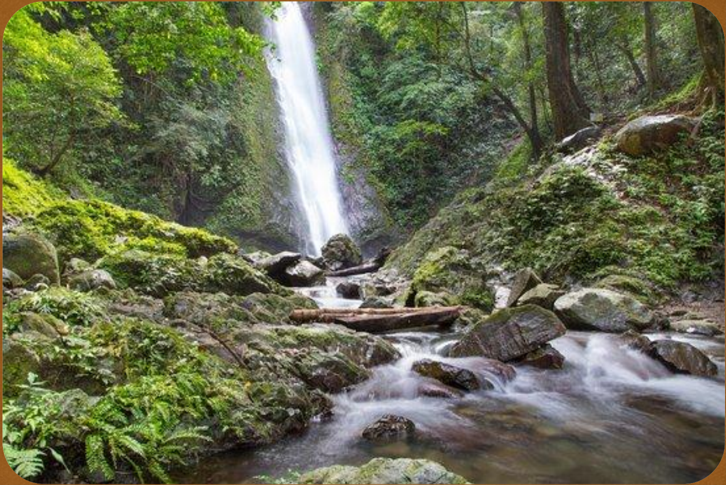
Kabigan Falls Town of Pagudpud