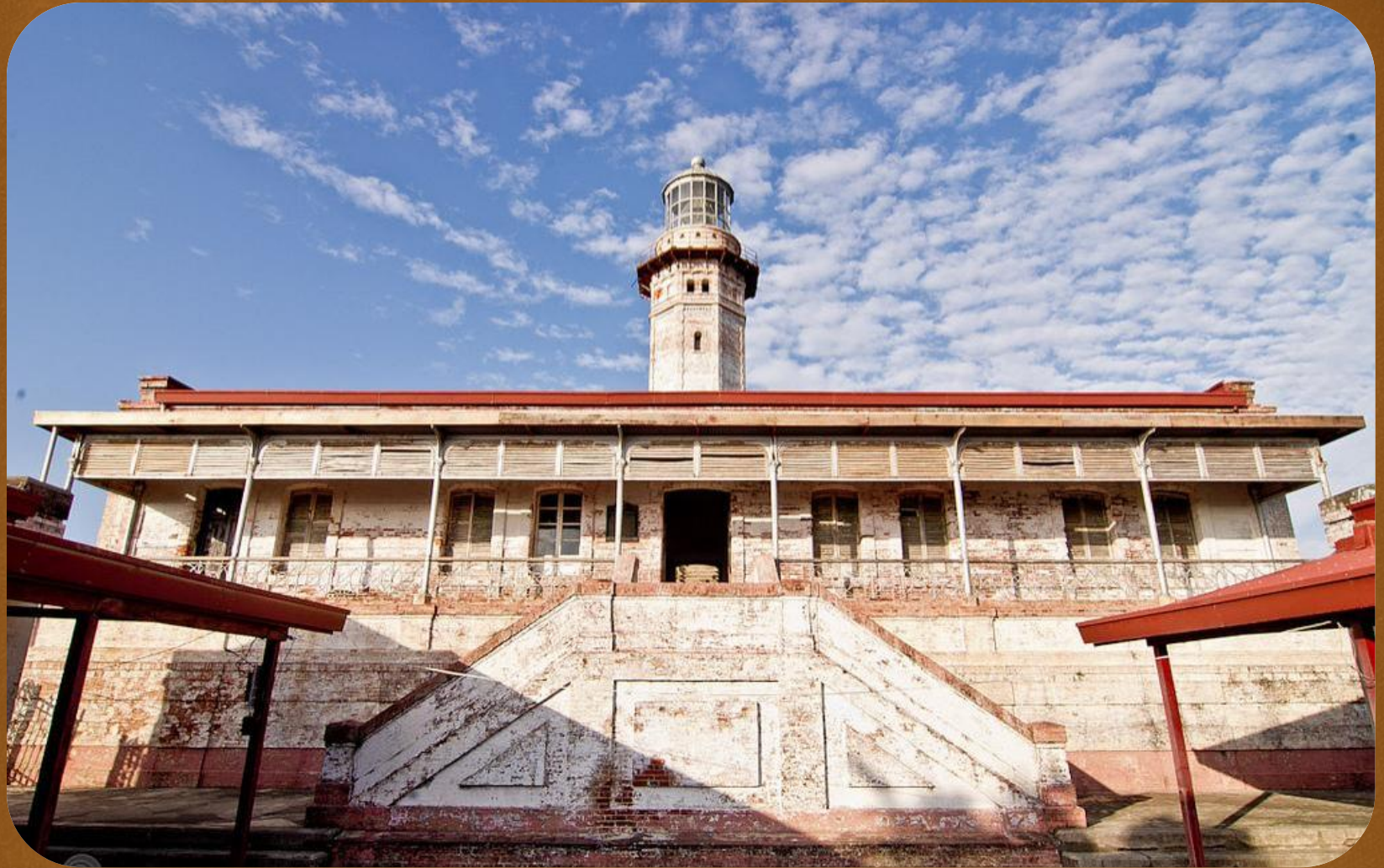
Cape Bojeador Lighthouse Town of Burgos