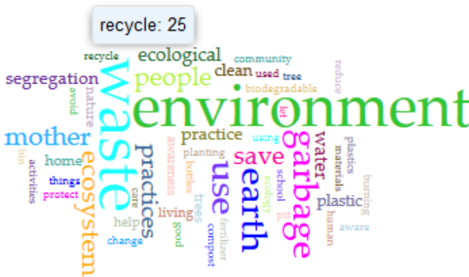
Figure 2. Word Cloud of the most frequently used words

Finally, to provide a picture of the most frequently used words in the paragraphs on ecology, thus, the formed word cloud is shown below.